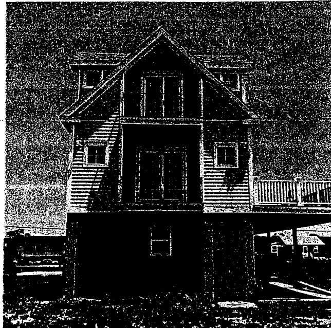
REAR VIEW - 6/24/16