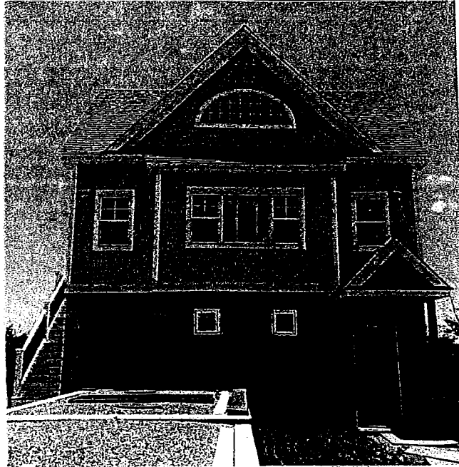
FRONT VIEW - 6/24/16

If using the Elevation Certificate to obtain NFIP flood insurance, affix at least 2 building photographs below according to the instructions for Item A6. Identify all photographs with date taken; "Front View" and "Rear View"; and, if required, "Right Side View" and "Left Side View." When applicable, photographs must show the foundation with representative examples of the flood openings or vents, as indicated in Section A8. If submitting more photographs than will fit on this page, use the Continuation Page.