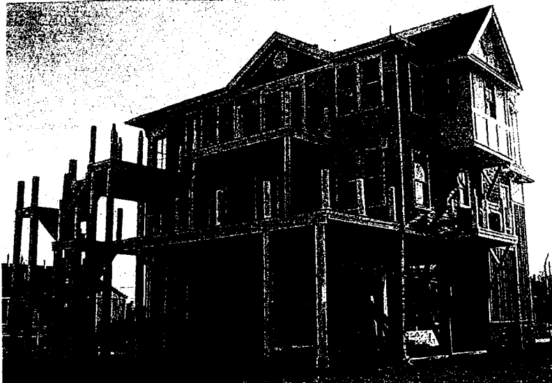
LEFT REAR VIEW - 5/21/14