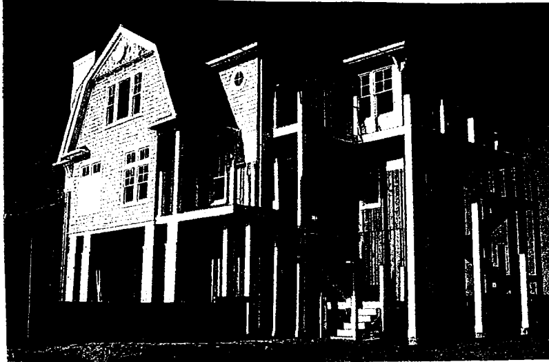
RIGHT FRONT VIEW - 5/21/14

If using the Elevation Certificate to obtain NFIP flood insurance, affix at least 2 building photographs below according to the instructions for Item A6. Identify all photographs with date taken; "Front View" and "Rear View"; and, if required, "Right Side View" and "Left Side View." When applicable, photographs must show the foundation with representative examples of the flood openings or vents, as indicated in Section A8. If submitting more photographs than will fit on this page, use the Continuation Page.