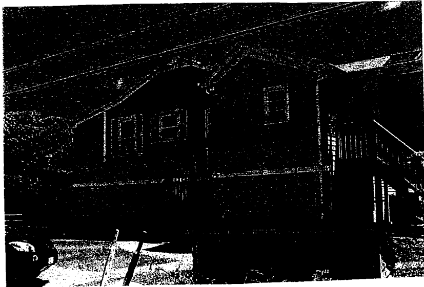
RIGHT SIDE VIEW - 6/14/16