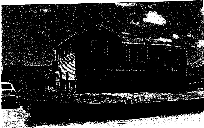
LEFT FRONT VIEW - 6/14/16

If using the Elevation Certificate to obtain NFIP flood insurance, affix at least 2 building photographs below according to the instructions for Item A6. Identify all photographs with date taken; "Front View" and "Rear View"; and, if required, "Right Side View" and "Left Side View." When applicable, photographs must show the foundation with representative examples of the flood openings or vents, as indicated in Section A8. If submitting more photographs than will fit on this page, use the Continuation Page.